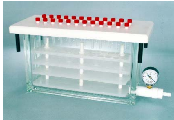
24 - Position System Part Number: VMF024GL

NOTE: A Complete Vacuum Manifold System includes a glass block, Corian® manifold lid, a cover gasket, a vacuum gauge and valve assembly, teflon tips (16 or 24), an adjustable collection rack, bulkhead luer fittings, plugs (16 or 24), and a glass block safety tray.