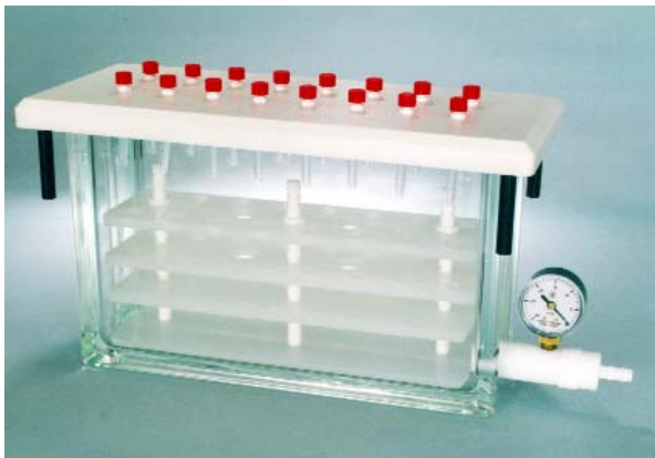
16 - Position System Part Number: VMF016GL

Corian® is a registered trademark of Dupont.